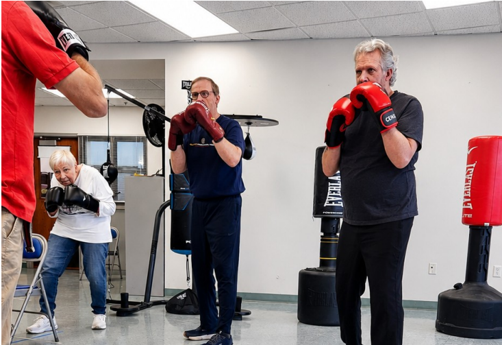
Members practicing boxing moves at the Center.