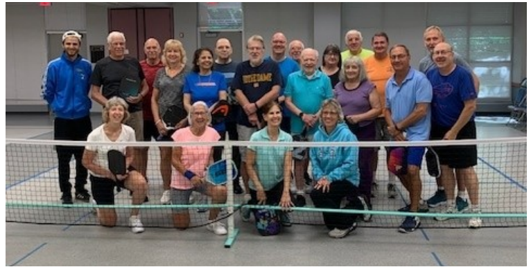
Participants from the 2025 Pickleball Tournaments at the Center.

Come play our 3 rd annual Pickleball Tournament. Round Robin format. Partners will be determined day of tournament.