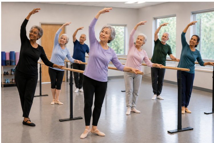
A group of people ballet stretching. (Stock image)