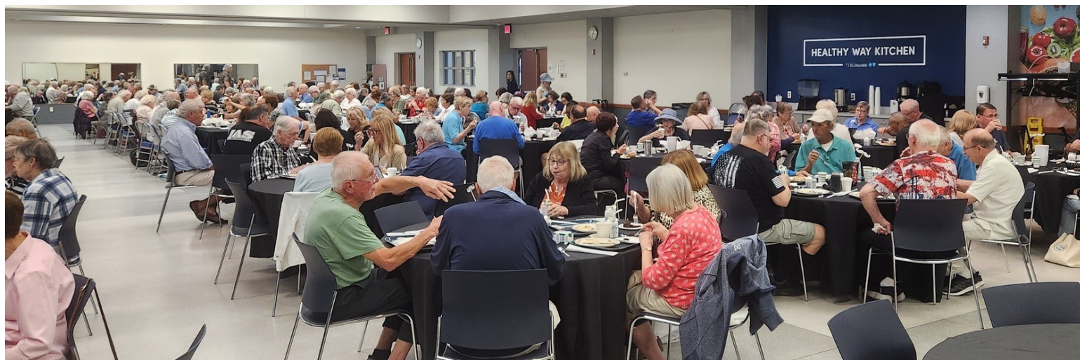
Congregate dining program at the Amherst Center for Senior Services.