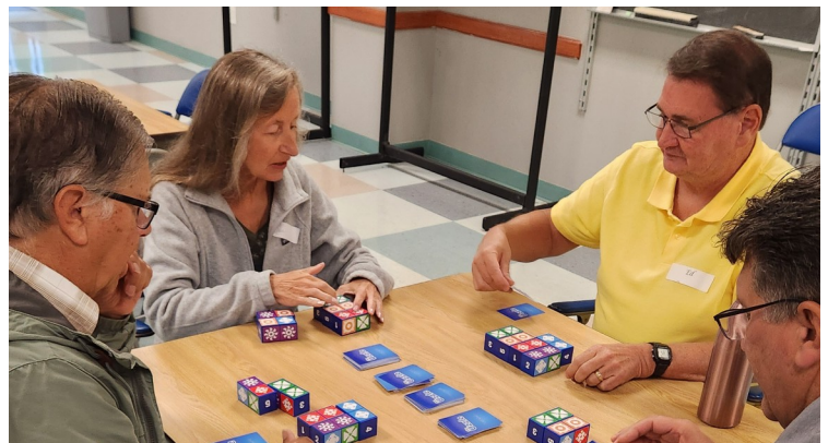
Members playing a mind teaser game at the Center.

Enjoy a snack while you play for fun. Free activity.