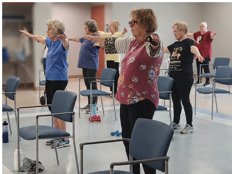
Members participating in a fitness class in the Center's Wellness Room.