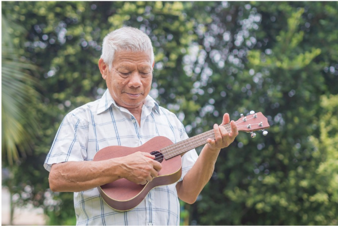
Ukulele player / Stock image