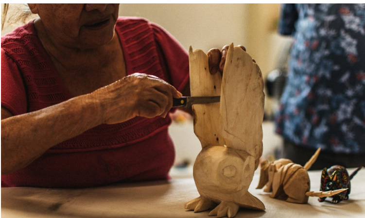
A person woodworking. (Stock photo)